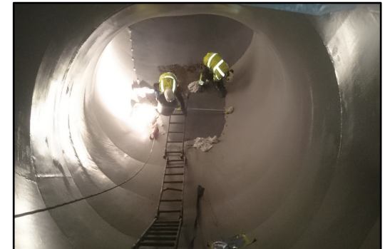
After: completing application of ARC 791

ARC repairs were carried out in <10 days and have continued to perform.